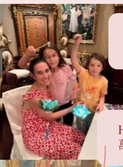
Mid-Autumn Festival Workshop 中秋佳節工作坊