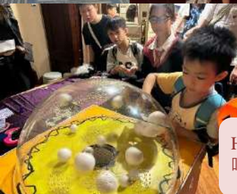
Halloween Carnival 喂嘩鬼叫朗峰夜