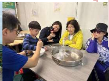
Hong Kong Ecology & Culture One Day Tour 香港文化及生態一日遊