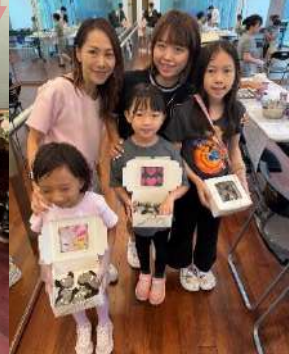
Halloween Workshop 萬聖鬼怪工作坊