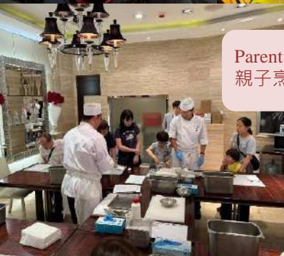
Parent & Child Cooking Class 親子烹飪班